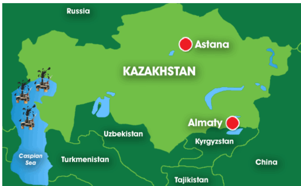
Figure 1: Map of Kazakhstan

Hosted by S.Seifullin Kazakh Agro Technical University, Astana, Kazakhstan this Dissemination visit involved delivery of intensive 2 day ASPIRE Curriculum Training and workshops. This training and workshops focussed upon the models and training methods employed throughout the project. The workshops were aimed at Regional stakeholders in Kazakhstan and focussed on various modules of the ASPIRE Curriculum such as the Use the Library module, Marketing , English for Specific Purposes (ESP) . The visit also included delivery of a selective and intensive training input of Library and Information Literacy Training Seminars to lecturing and library staff as well as postgraduates of S.Seifullin Kazakh Agro Technical University.