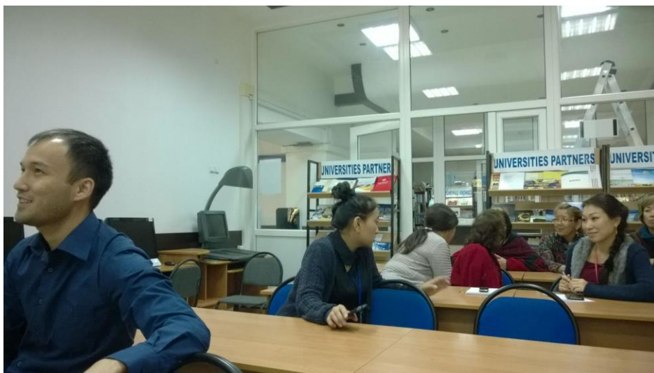
Participants engage in workshop activities at the ASPIRE Dissemination Workshops at S. Seifullin Kazakh Agro

The Dissemination Workshops focussed on the ASPIRE project and its main aims- to foster the rights of individuals with special needs to access education and enjoy the right of participation in everyday society. The programmes focussed particularly on the ASPIRE Curriculum developed by the project which is aimed at improving access to education for people with disabilities.